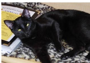
Guinness shows his PAL spirit by using Tricky Tray flyers as a pillow

Intact animals are not only prone to accidental breedings, but also to cancers of the reproductive organs.